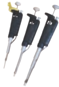
3 Pipetman pipettes