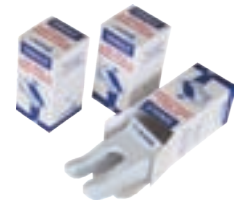
Three Single™ pipette holders